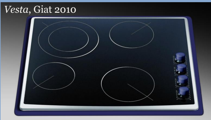
Vesta, Giat 2010