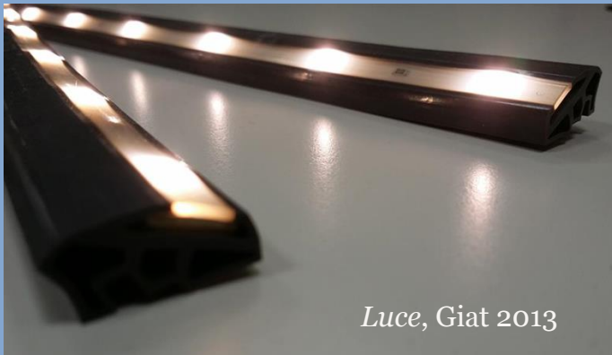
Luce, Giat 2013

Giat has been working in the home appliances sector for over fifty years, where it has gained great experience working with famous brands. In recent years we approached design to explore new ways to use silicone as main material and create products that have a complete different touch and feeling experience. In one of the most successful projects, commissioned by a famous kitchen brand, Giat employed photoluminescent edge covers to make it easy for users to access the kitchen at night. Among other project, related to the kitchen, Giat is working on there are: colored and thermocromatic hobs, colored oven door gaskets and LED oven door gaskets that perfectly light up the oven.