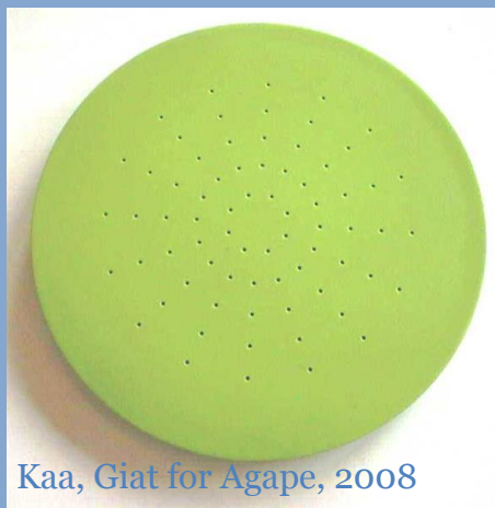
Kaa, Giat for Agape, 2008