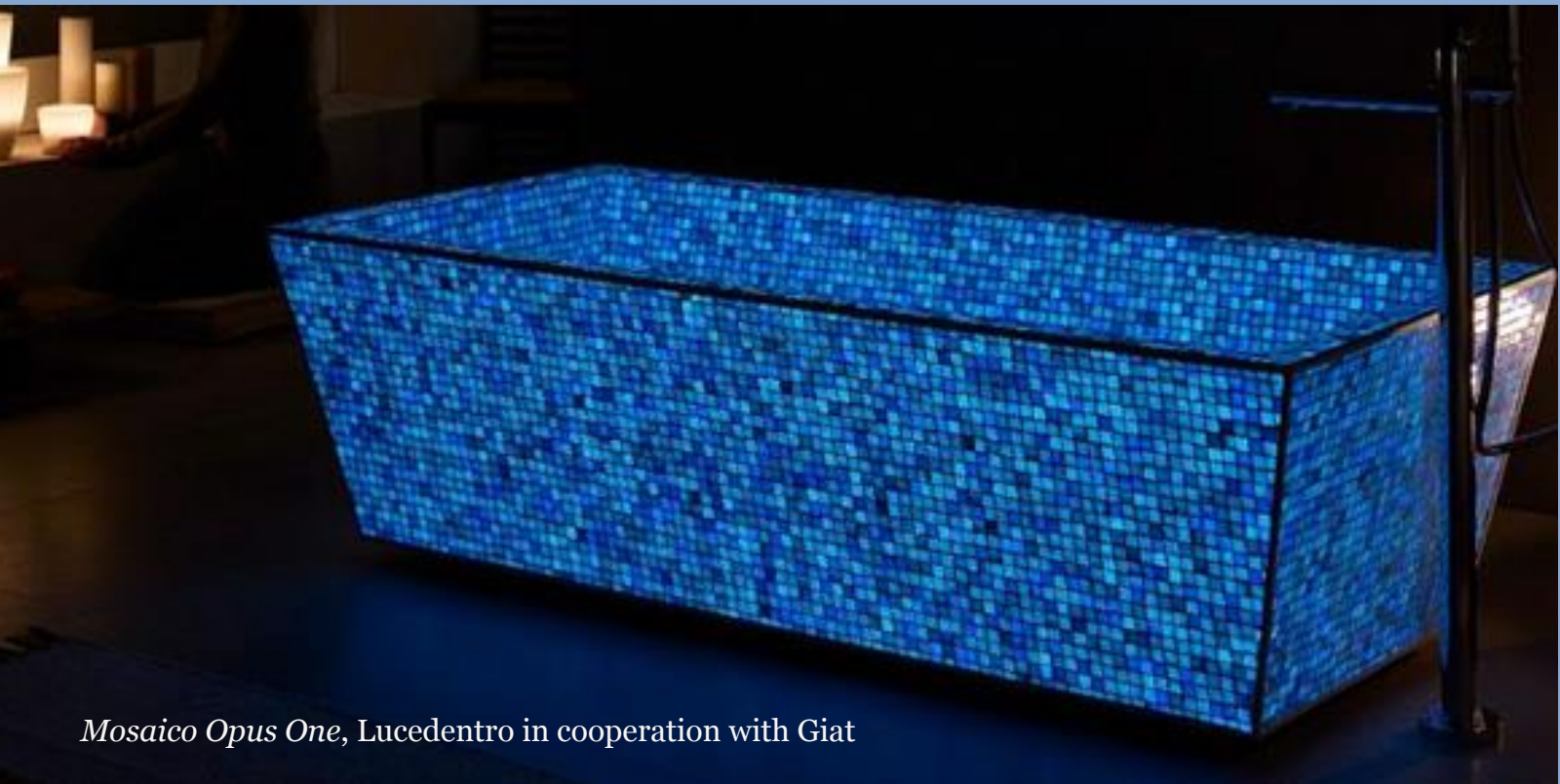
Mosaico Opus One, Lucedentro in cooperation with Giat

In bathroom design Giat has started a fascinating project, taking advantages from the expertise of Lucedentro, a specialist in photoluminescent pigments, to create evocative bath environments. Giat has also worked for some well-known brands, such as Agape and Mamoli, for the creation of special faucets, combining silicon's technical features with rubber versatility.