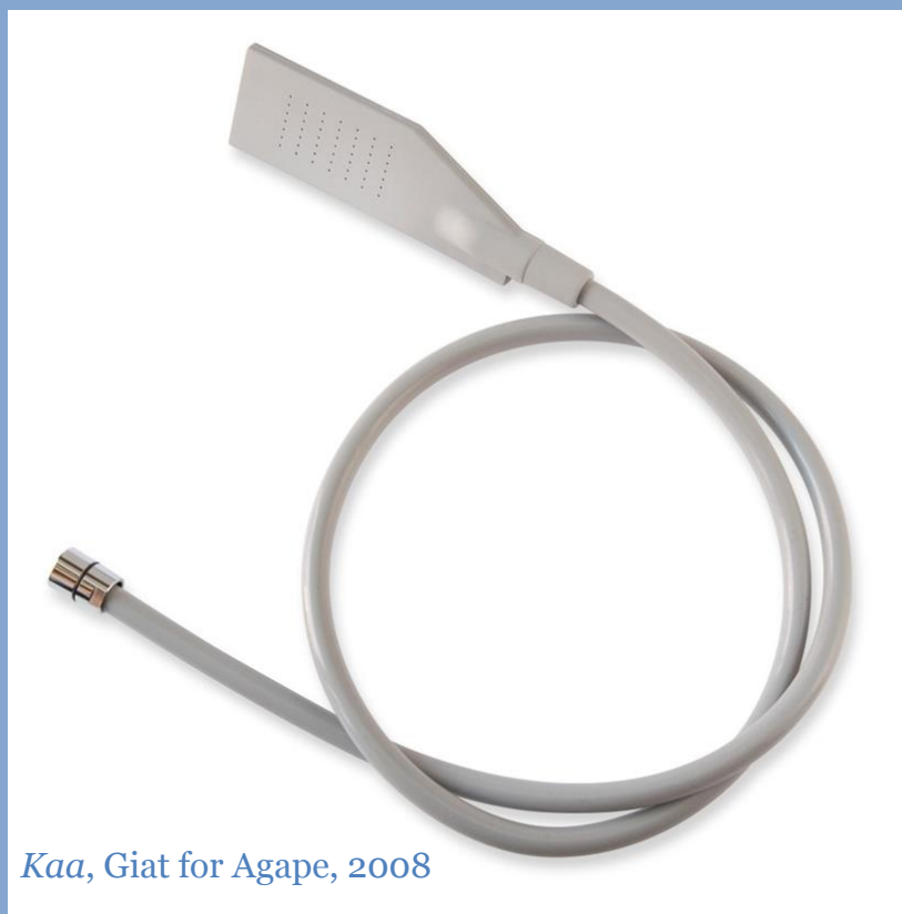
Kaa, Giat for Agape, 2008