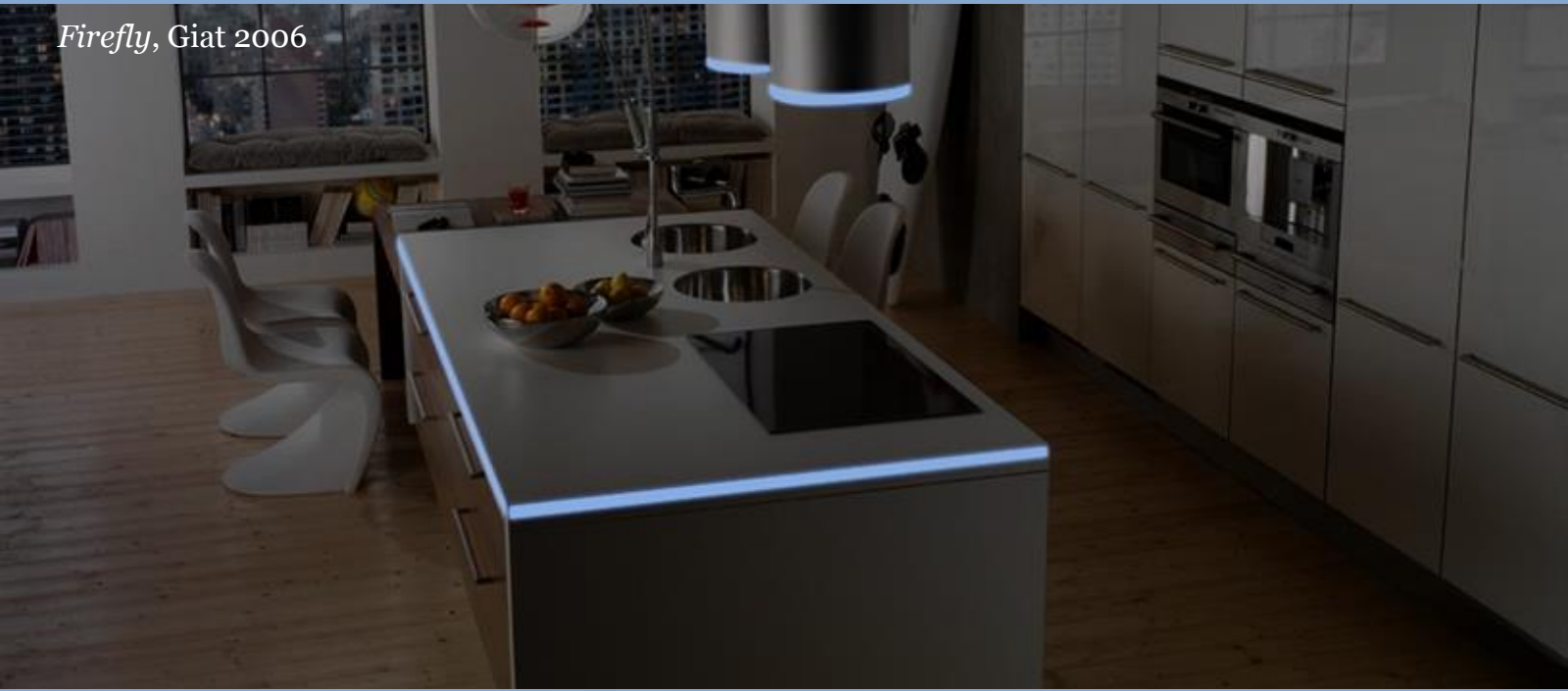
Firefly, Giat 2006

Giat has been working in the home appliances sector for over fifty years, where it has gained great experience working with famous brands. In recent years we approached design to explore new ways to use silicone as main material and create products that have a complete different touch and feeling experience. In one of the most successful projects, commissioned by a famous kitchen brand, Giat employed photoluminescent edge covers to make it easy for users to access the kitchen at night. Among other project, related to the kitchen, Giat is working on there are: colored and thermocromatic hobs, colored oven door gaskets and LED oven door gaskets that perfectly light up the oven.