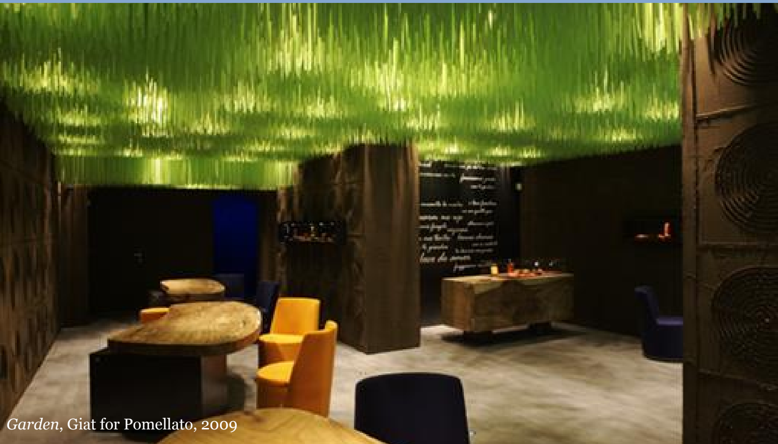
Garden, Giat for Pomellato, 2009

Using fantasy and colors to build charming environments is what Giat has experimented. With Pomellato we used fantasy and colors to build a charming environment for all its showrooms worldwide: using irregular green stripes of silicone, Giat created a surreal grass like ceiling. Giat is also working at products' design together with Lucedentro, to create accessories and furnishings. Silicone is suitable for very different design applications, just for the possibility to mix it with photoluminescent or thermocromatic materials, or even to make it precious with metal inserts.