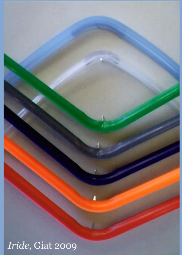
Iride, Giat 2009